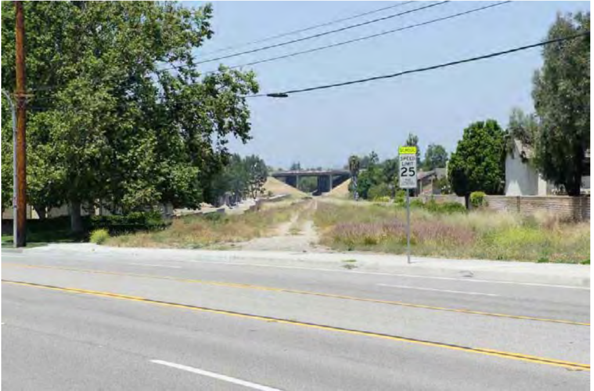
57 Freeway Undercrossing (from Birch St)