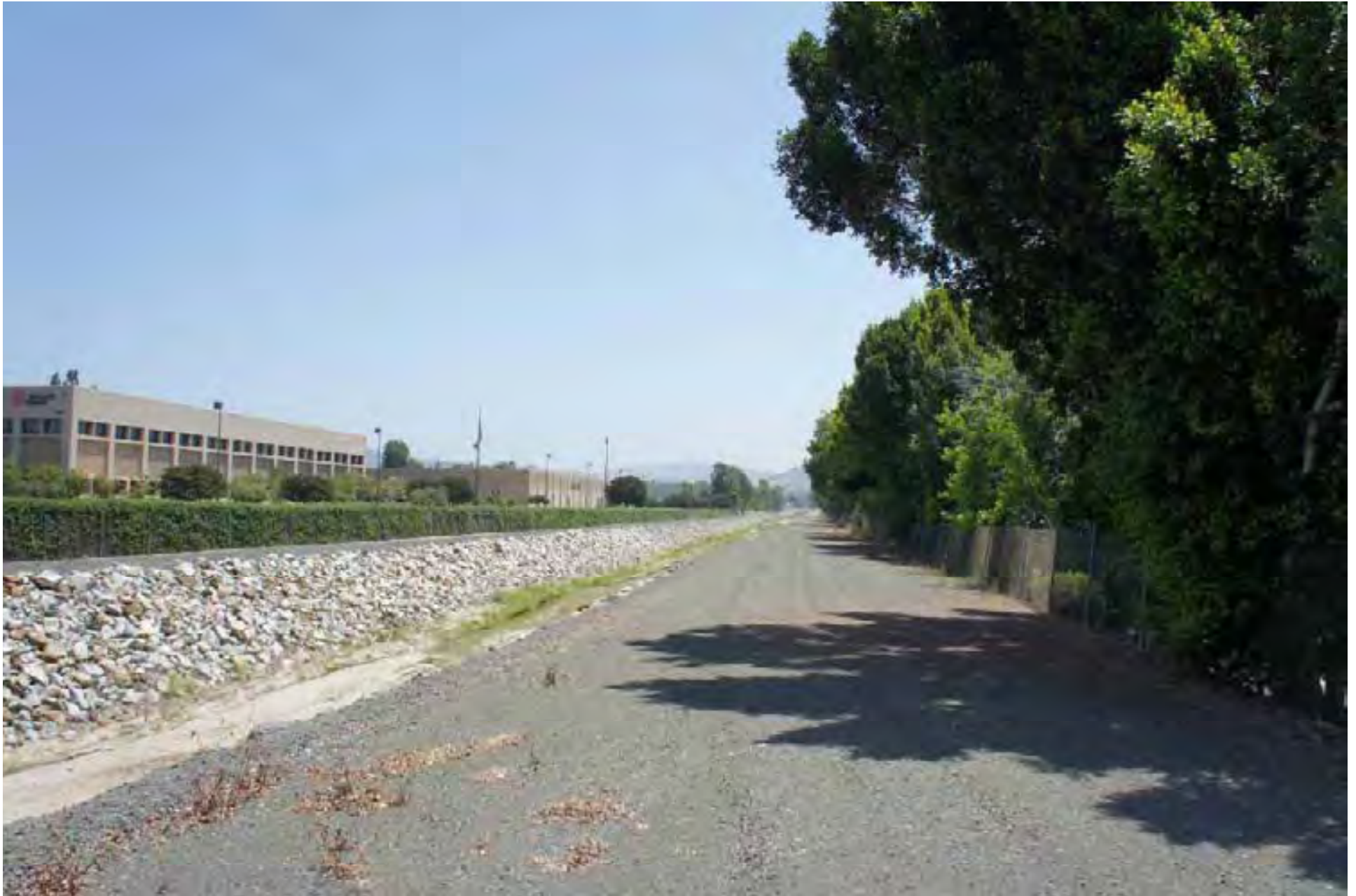
Service road along Loftus Channel