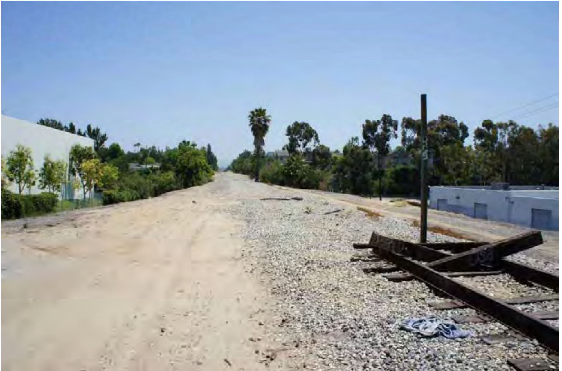
Active rail terminus e/o Berry Street