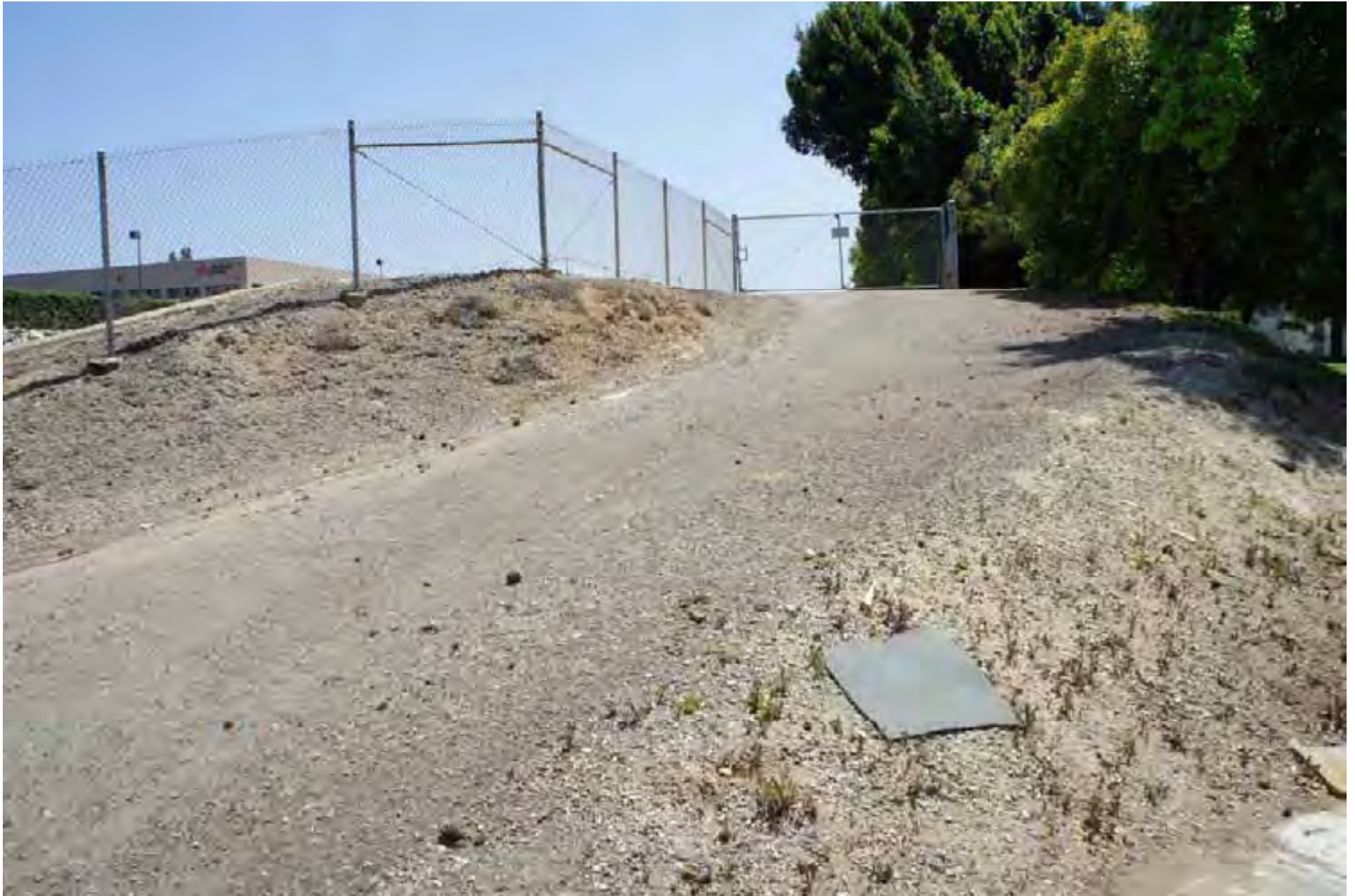
Ramp to Loftus Channel levee