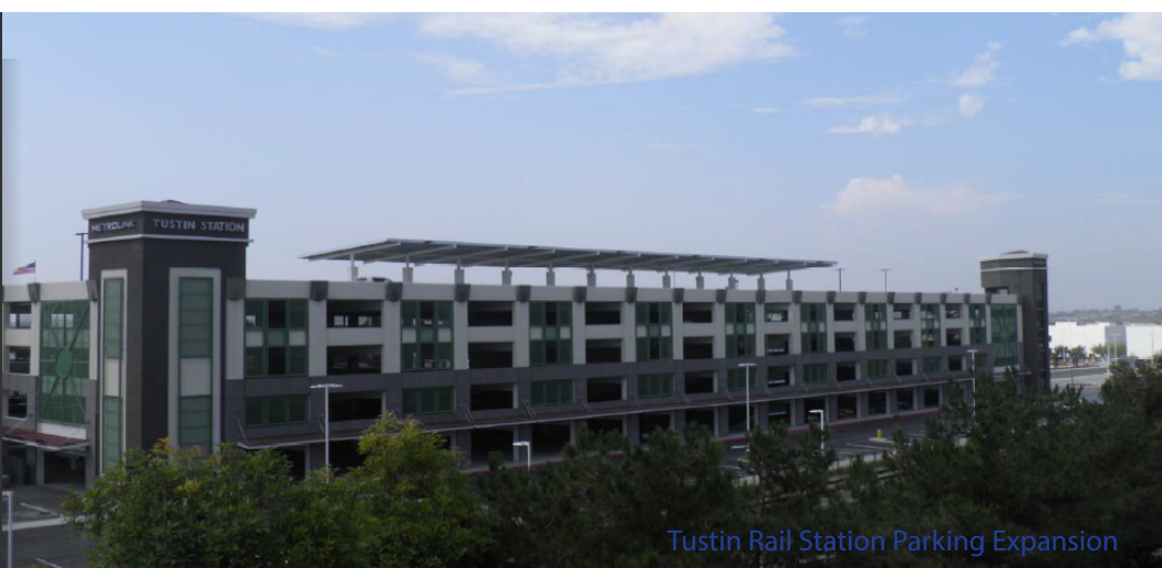
Tustin Rail Station Parking Expansion