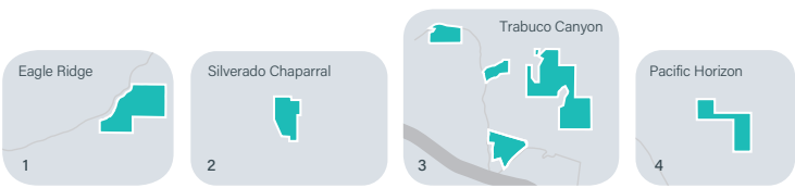
ENVIRONMENTAL MITIGATION PROGRAM PRESERVES