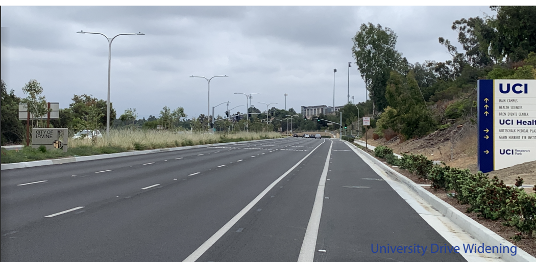
University Drive Widening