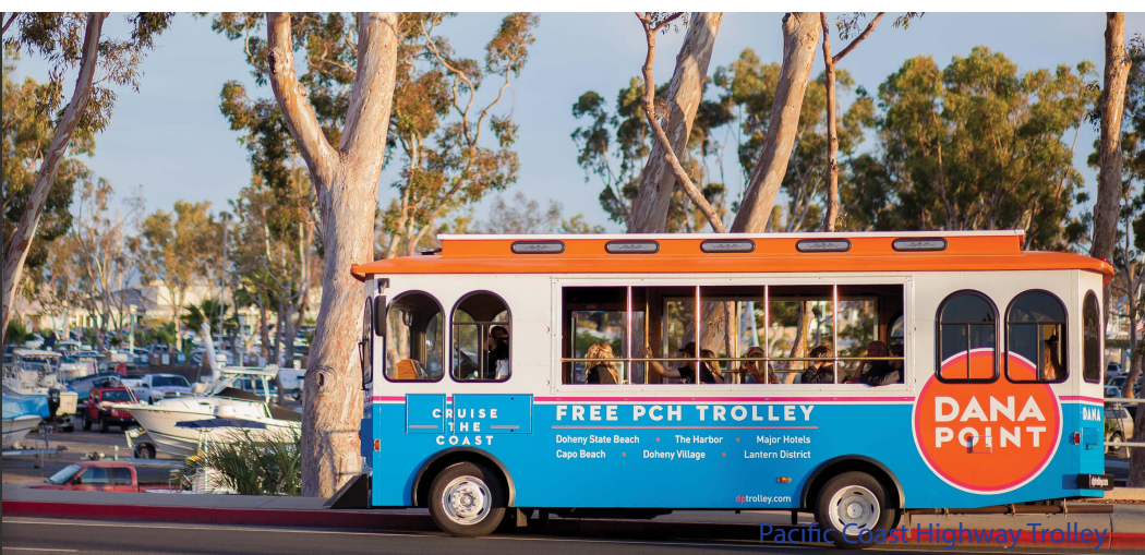
Pacific Coast Highway Trolley