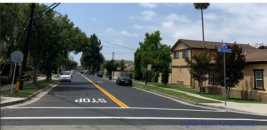
Eighth Street Rehabilitation