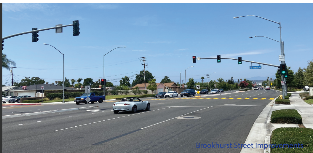
Brookhurst Street Improvements