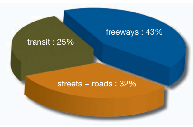
Measure M1 Fund Allocation

During the 1980s, Orange County's economy boomed and its population grew. County transportation and elected officials envisioned an expanded transportation system that would sustain economic growth and ensure future mobility. Without delay, a long-range transportation improvement plan was developed that would keep Orange County moving into the approaching 21st Century.