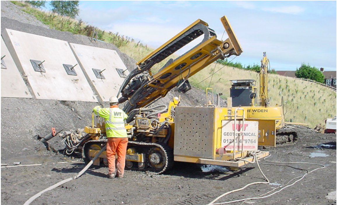
Example of ground anchor installation

The Orange County Transportation Authority, in coordination with Metrolink, is working to stabilize railroad tracks through south San Clemente. Crews will install ground anchors into the large slope between the railroad tracks and the Cyprus Shore community to prevent further slope movement. More than 230 steel anchors will be drilled into bedrock deep beneath the slope.