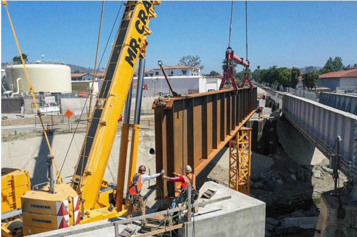
Crews installing the steel superstructure for the new railroad bridge.