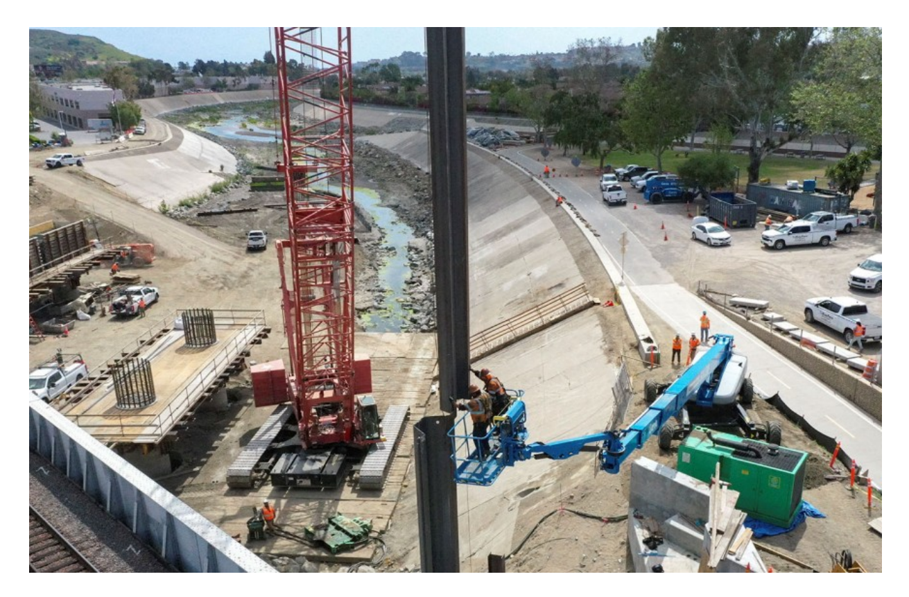
Contractors installing sheet pile walls

The installation of steel beams, also referred to as "sheet piles," is underway. This work requires drilling 100-foot-long sheet piles along the slope embankment within San Juan Creek using vibratory and diesel hammers. The surrounding community may be impacted by noise and vibration from this activity. This work is ongoing through mid-June, between 6 a.m. and 5 p.m., Monday through Friday.