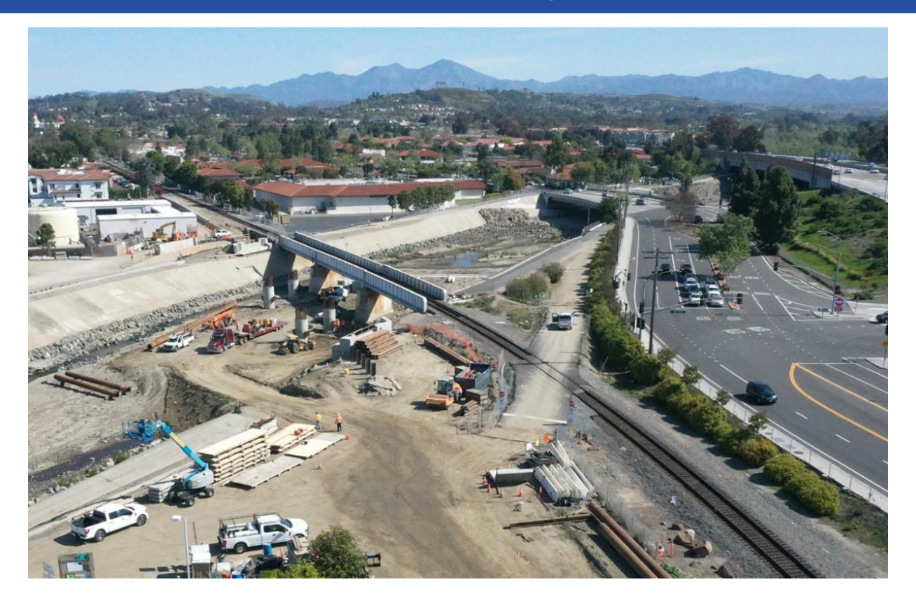
Construction activities in San Juan Creek.