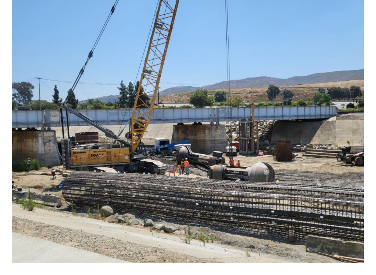
Crews working on bridge foundation in the creek