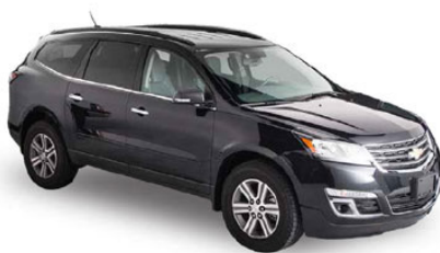
Figure 7-3 OC Vanpool Employer-Focused Advertising