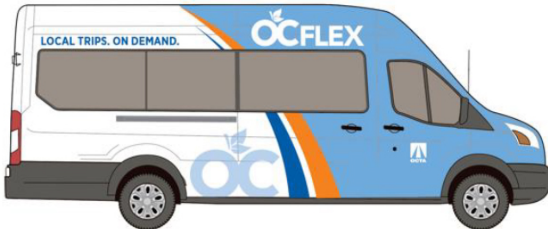
Figure 7-1 OC Flex Vehicle

OC Flex is OCTA's attempt to use emerging technology to offer a new type of service that has the potential to both better serve some existing customers as well as attract new customers. It might also serve as a replacement for fixed-route service in areas where regular bus service has proven costly and ineffective. At the same time, microtransit can extend the reach of the fixed-route system by providing connections to areas not served by regular transit. Successful micro-transit services could serve as the foundation for new fixed-route bus service.