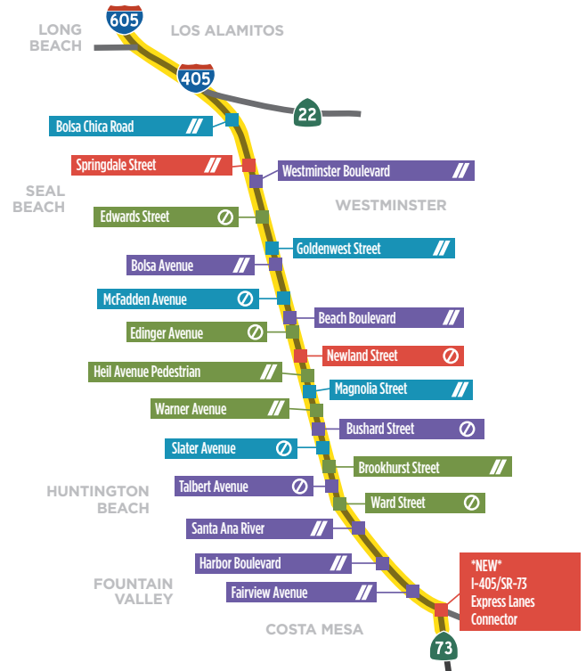
Bridge Map as of 7/2/20