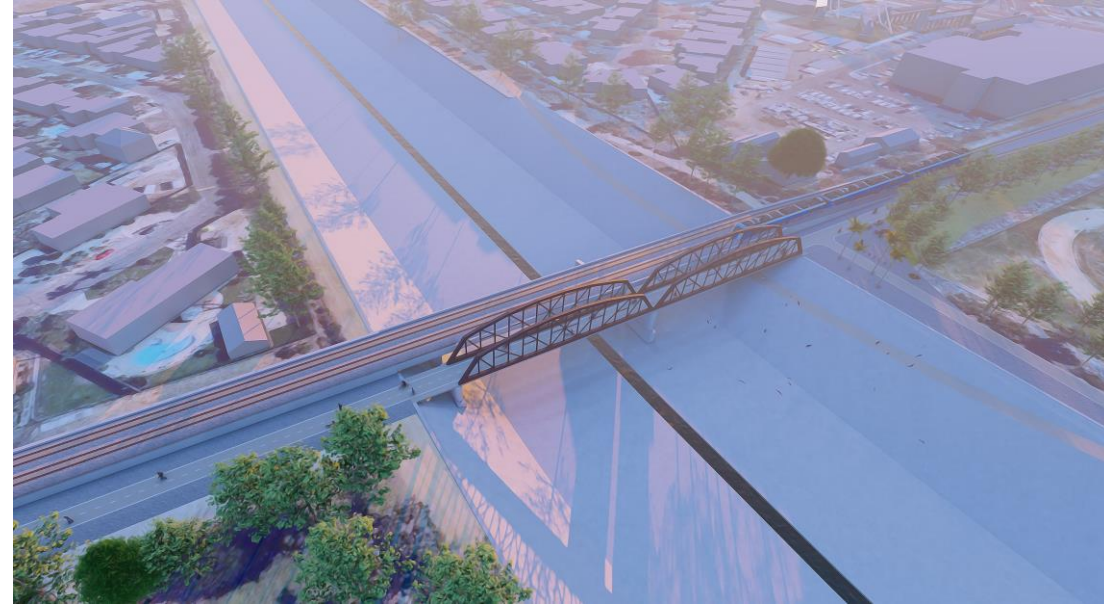
Rendering of future trail connection across the Santa Ana River