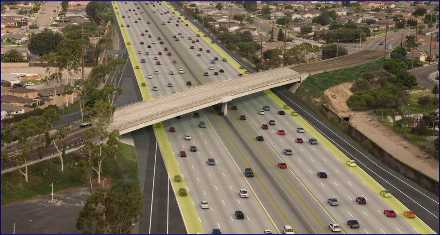
Rendering of Interstate 405 looking northwest at Springdale Street overcrossing