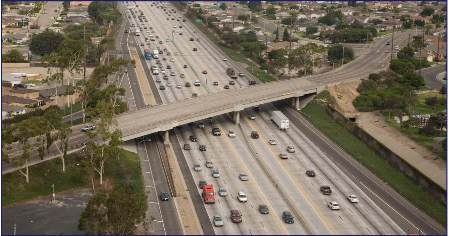
Rendering of Interstate 405 looking northwest at Springdale Street overcrossing