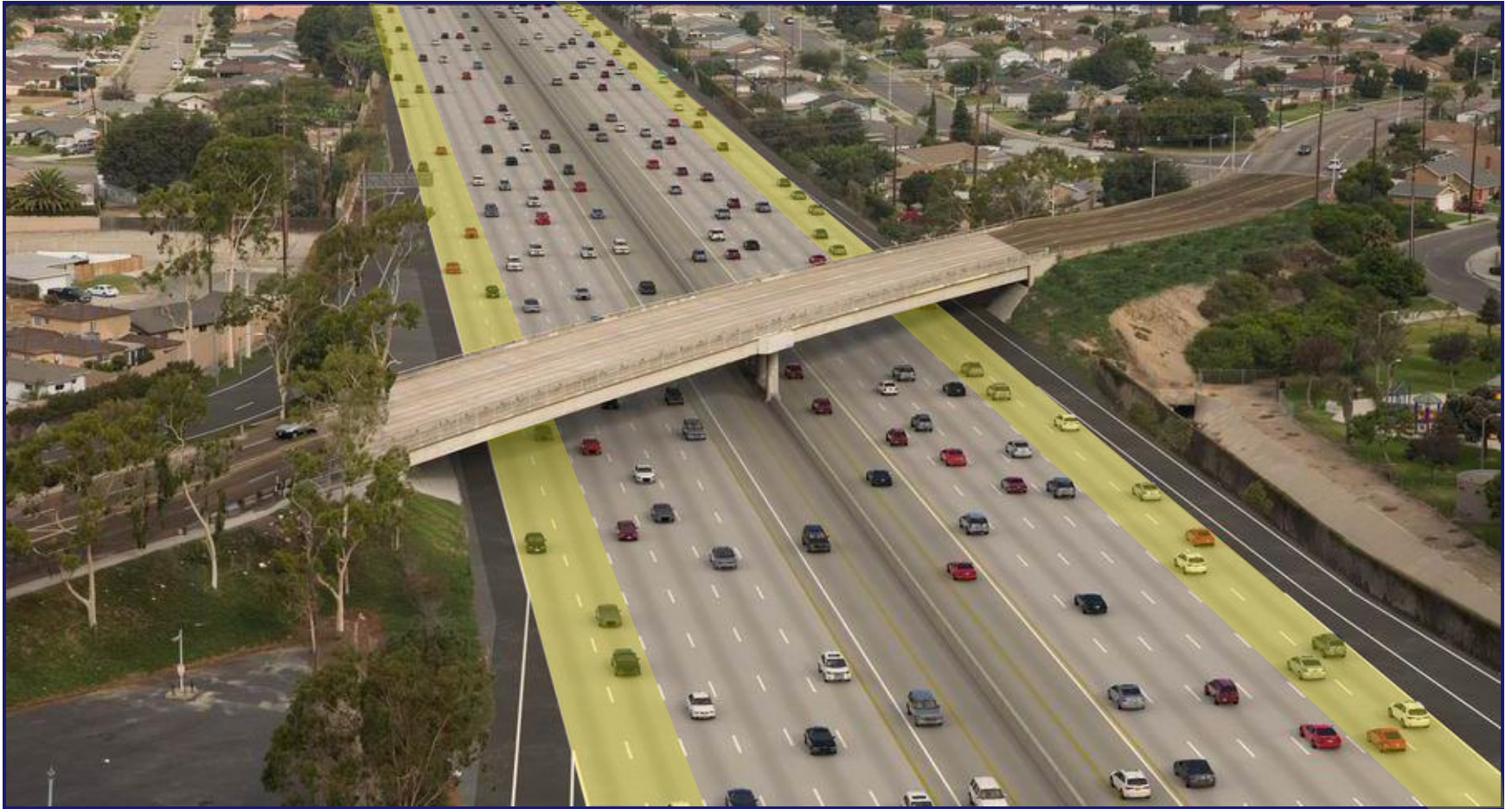
Rendering of Interstate 405 looking northwest at Springdale Street overcrossing