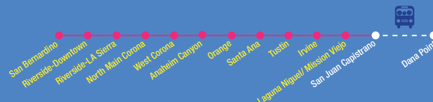
INLAND EMPIRE - ORANGE COUNTY LINE TO FESTIVAL OF WHALES