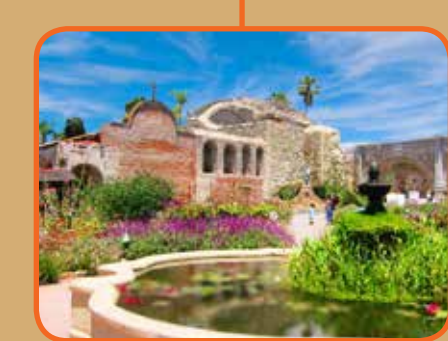
San Juan Capistra