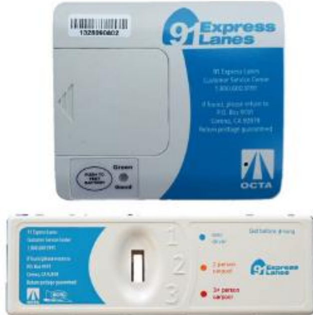
Title 21 Transponders