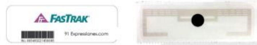
6C Switchable Transponders (Prototypes)