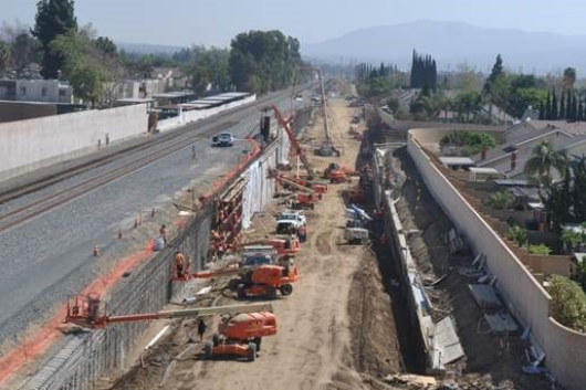
Photo: Looking east at Crowther Avenue and Kraemer Boulevard intersection