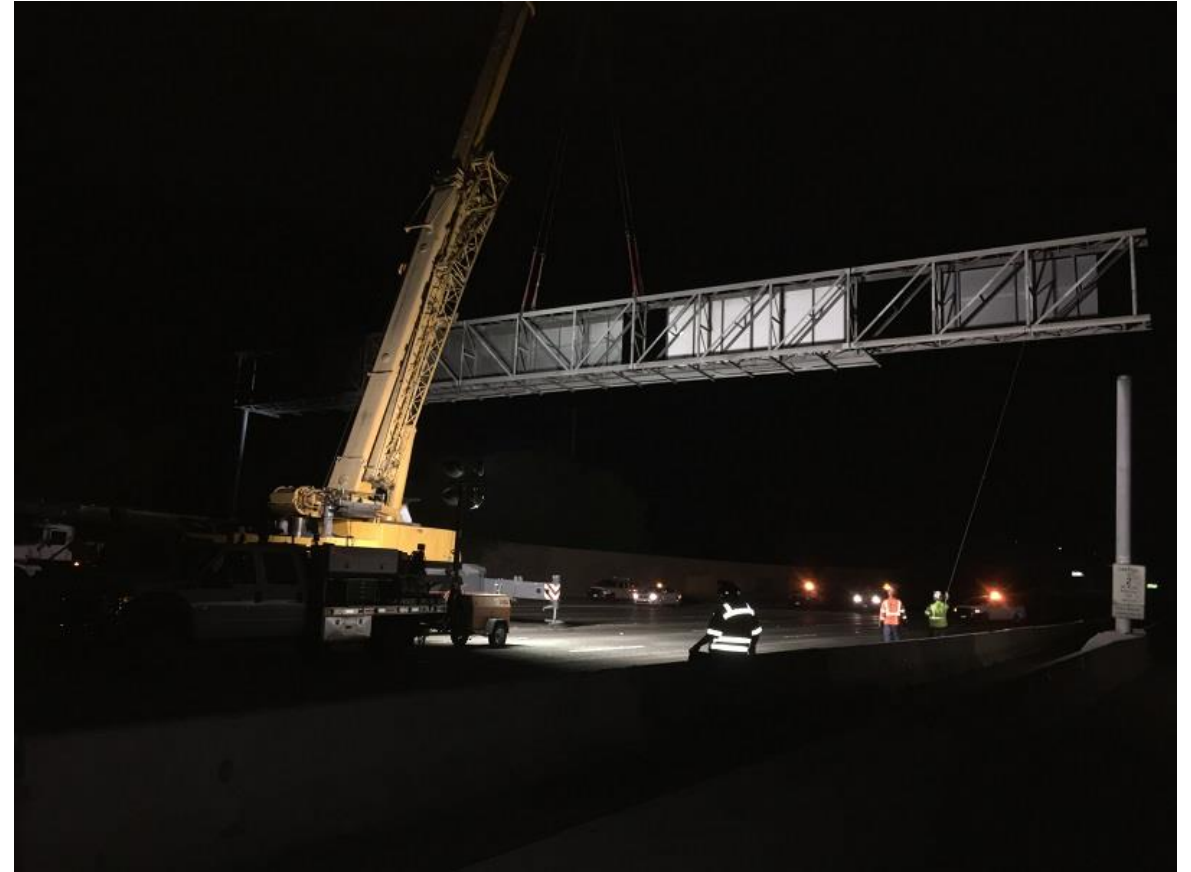
Overhead sign removal