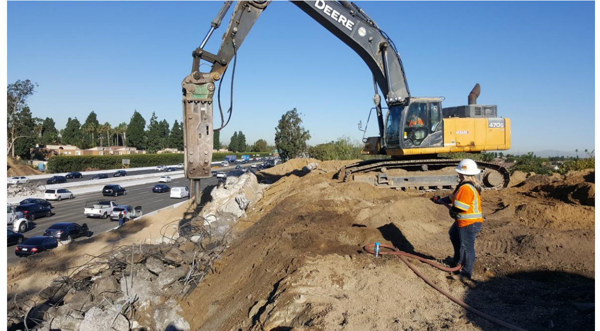
Slater Avenue full bridge demolition – September 2018