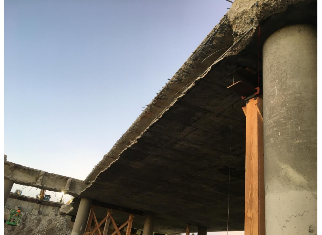
Bolsa Chica Road partial bridge demolition – December 2018