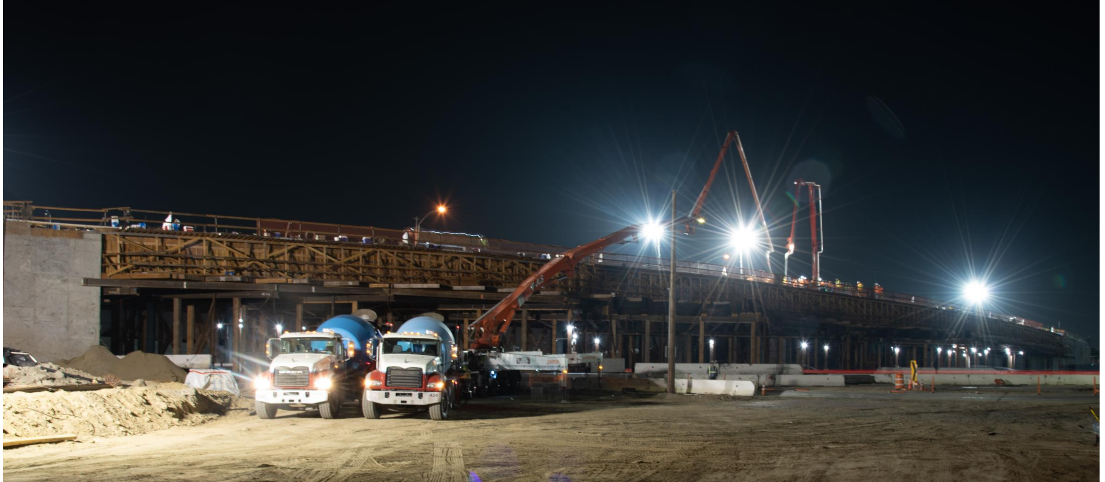
Bolsa Avenue bridge construction