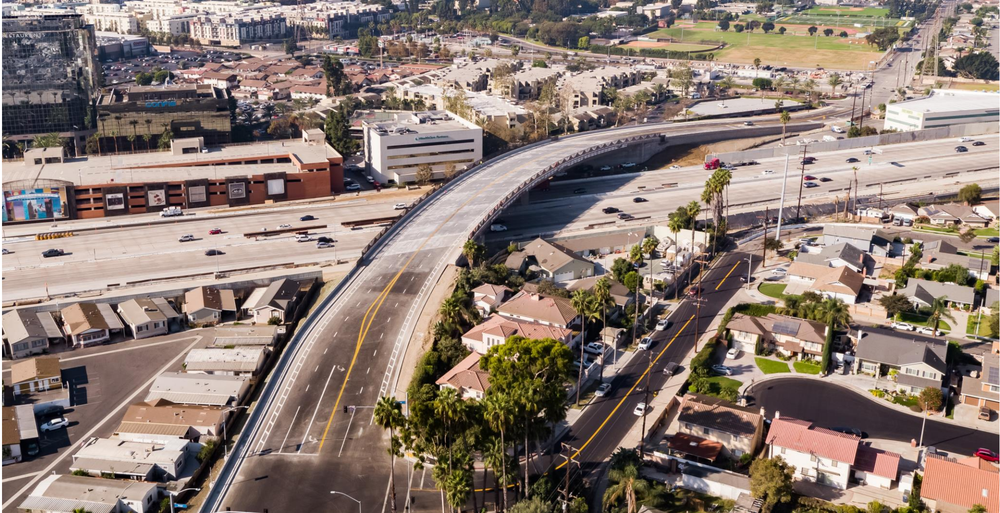
McFadden Avenue bridge complete