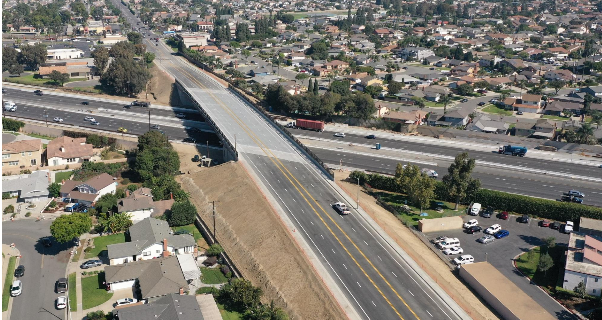
Bushard Street bridge complete