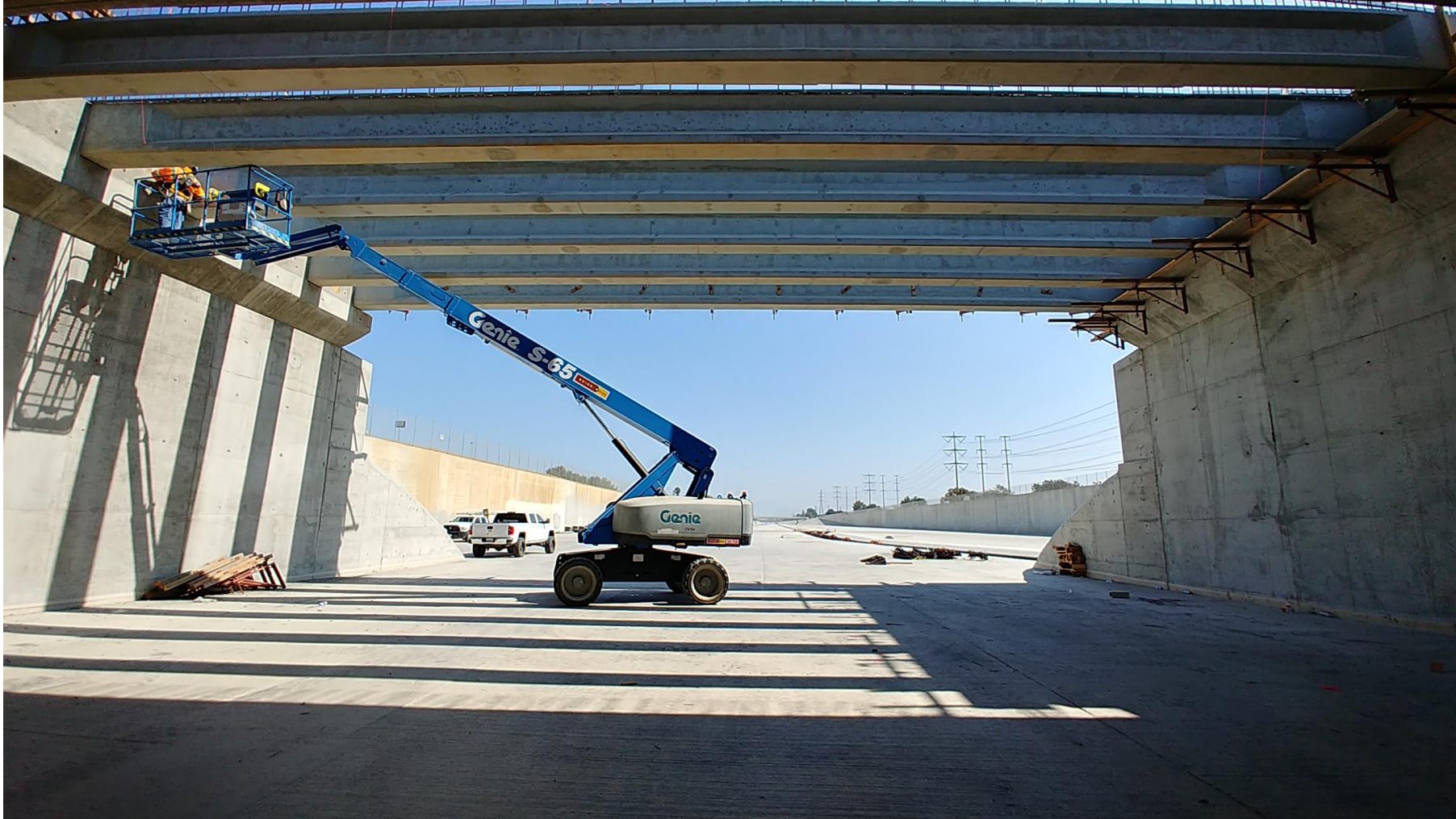
Santa Ana River bridge construction