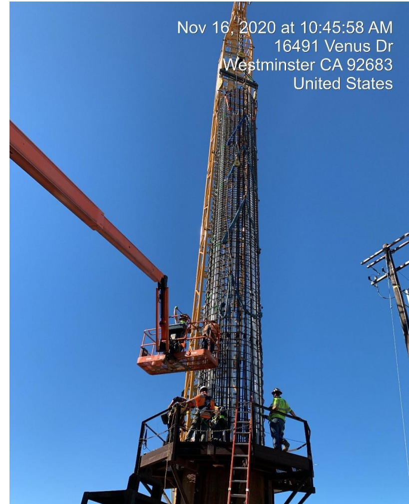
Heil Avenue pedestrian overcrossing (POC) construction