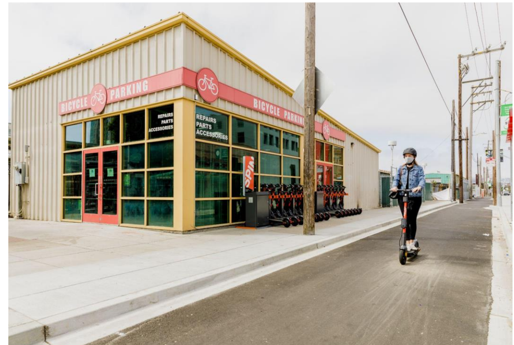
San Francisco, Caltrain SF Mobility Hub