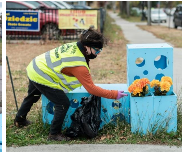
Minneapolis, Mobility Hubs