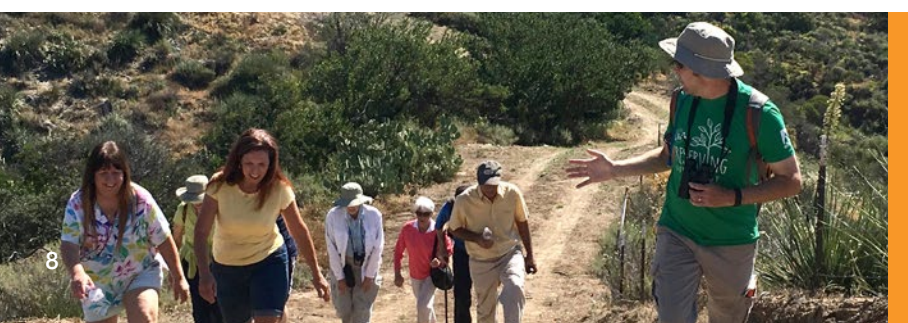
Providing a series of equestrian rides and hikes helped connect residents with the protected wilderness preserves that are a key part of OCTA's commitment to the environment.

• Awarded a contract for construction of bus wash water runoff mitigation and modifications at all OCTA bus bases.