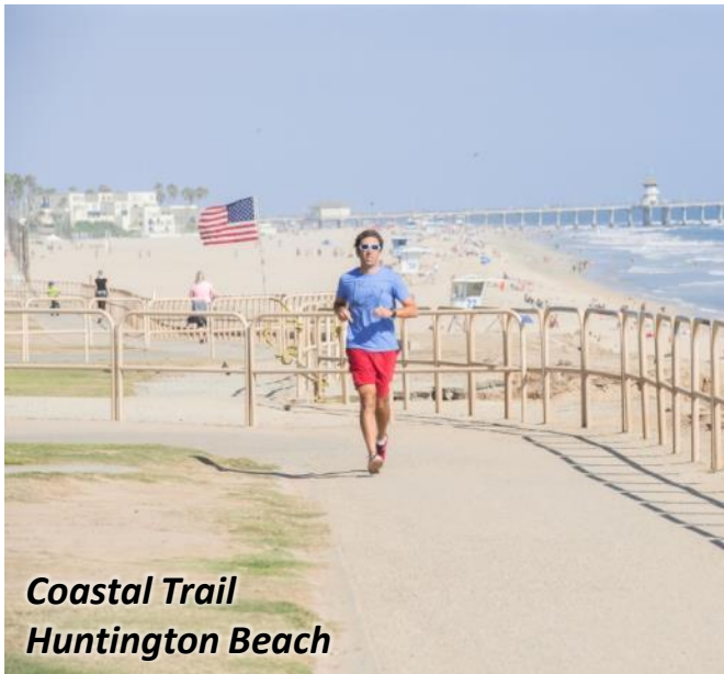
Coastal Trail Huntington Beach