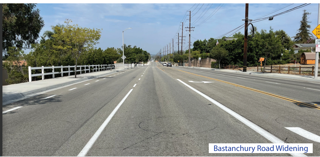
Bastanchury Road Widening