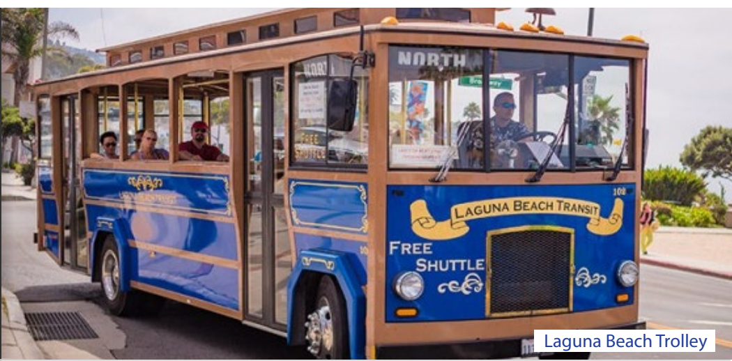
Laguna Beach Trolley