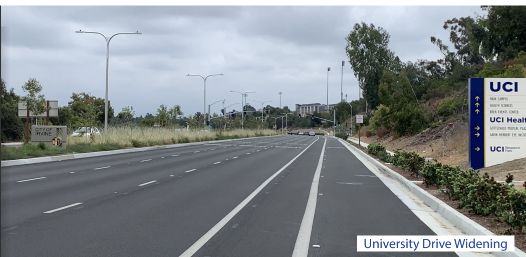
University Drive Widening