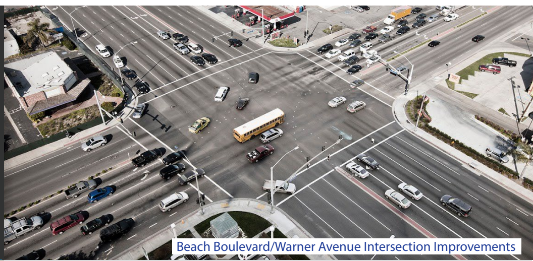
Beach Boulevard/Warner Avenue Intersection Improvements