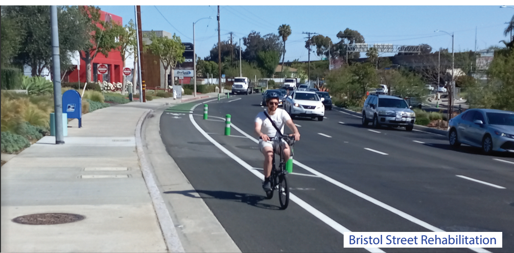
Bristol Street Rehabilitation