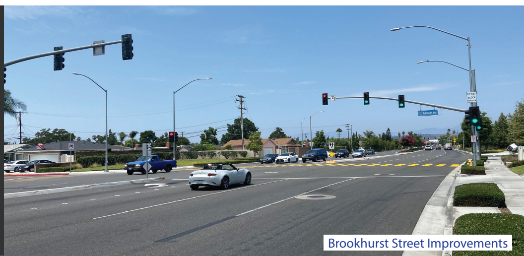
Brookhurst Street Improvements