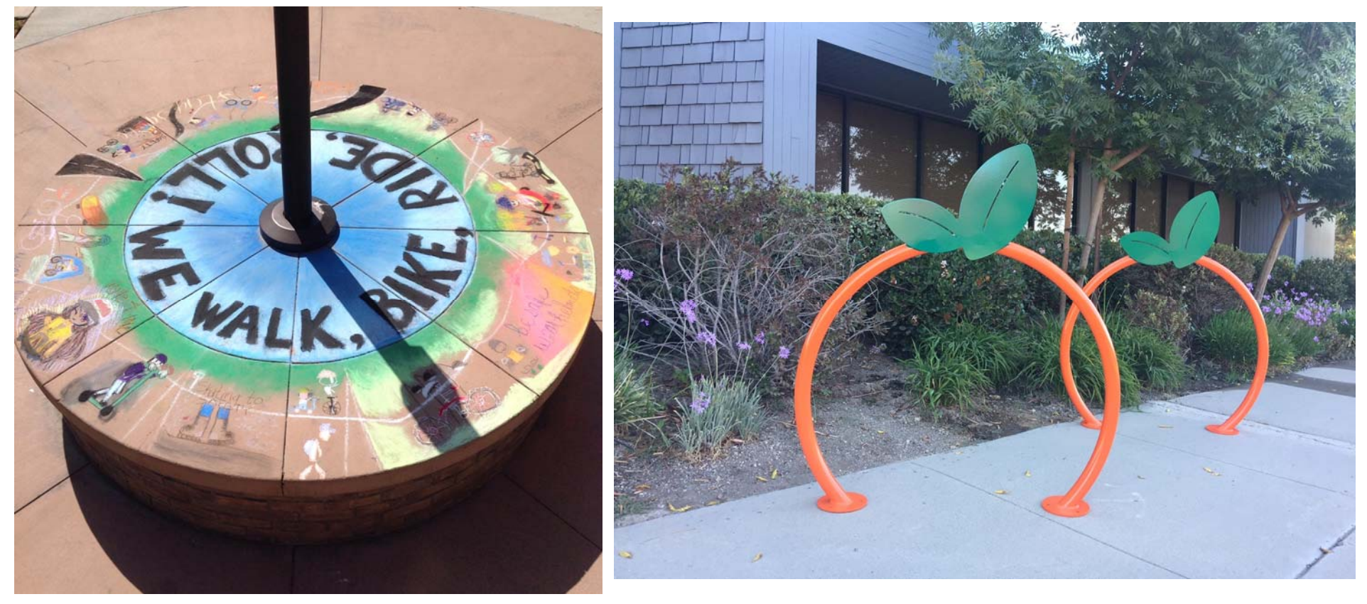
Jeffrey Trail Middle School