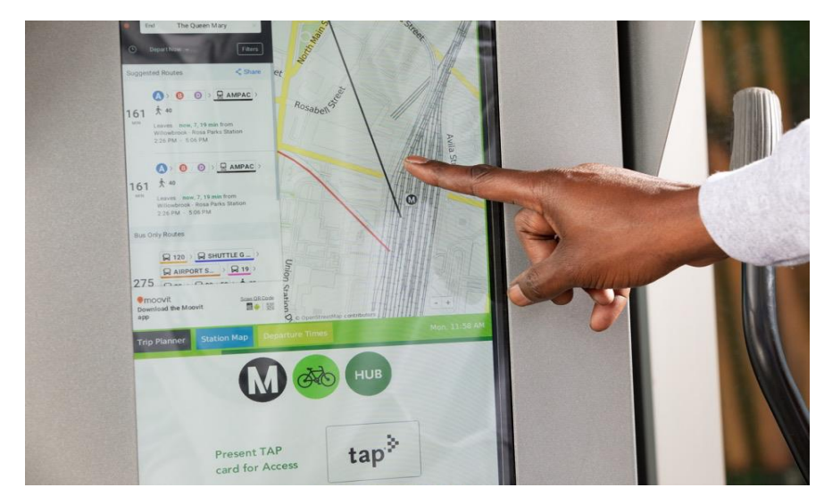
Tranzito Mobi kiosks

... are part of a physical/digital/policy framework to connect all modes of mobility to encourage multimodal travel.