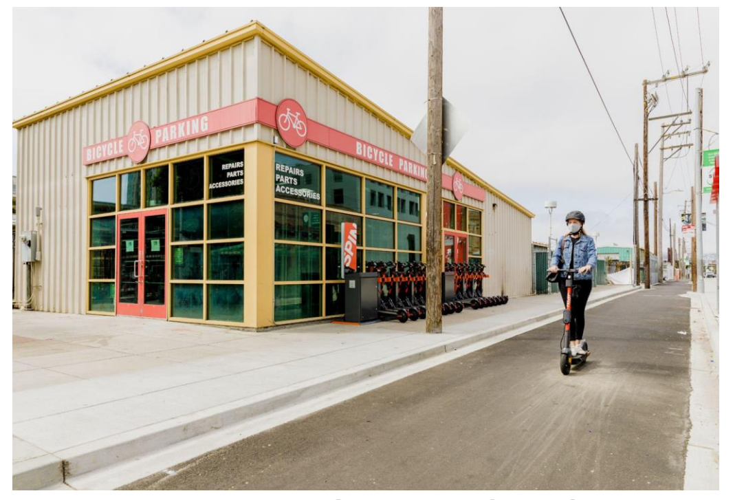
San Francisco, Caltrain SF Mobility Hub