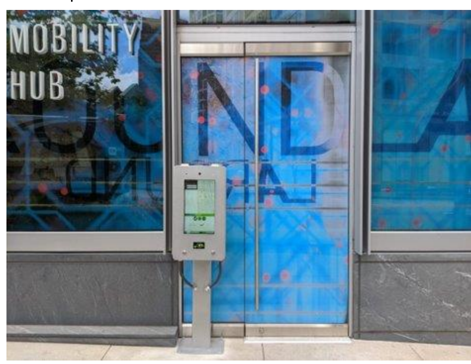
Los Angeles, Wilshire Grand new mobility hub

\dots provide a focal point in the transportation network that seamlessly integrates different modes of transportation