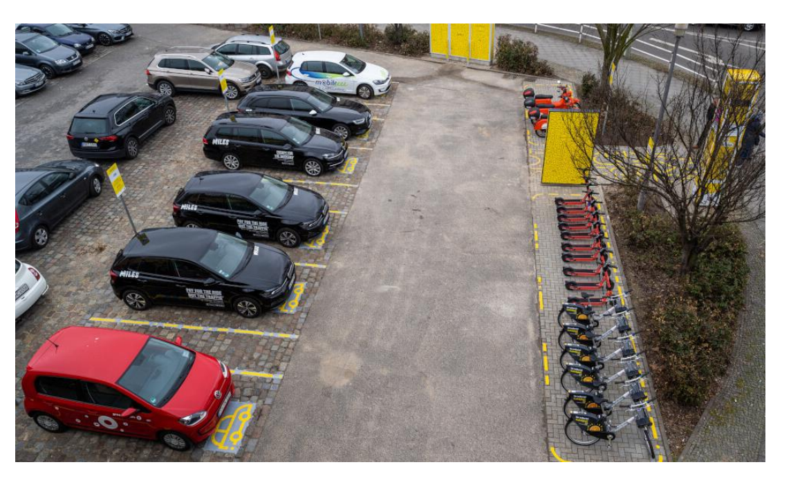
Berlin, Jelbi Station