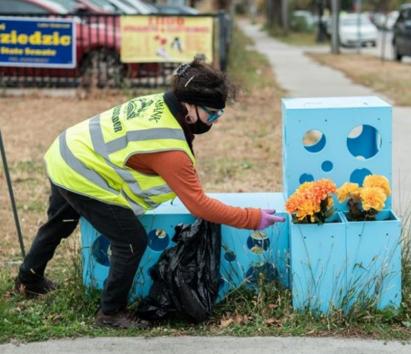
Minneapolis, Mobility Hubs