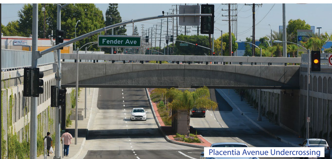
Placentia Avenue Undercrossing