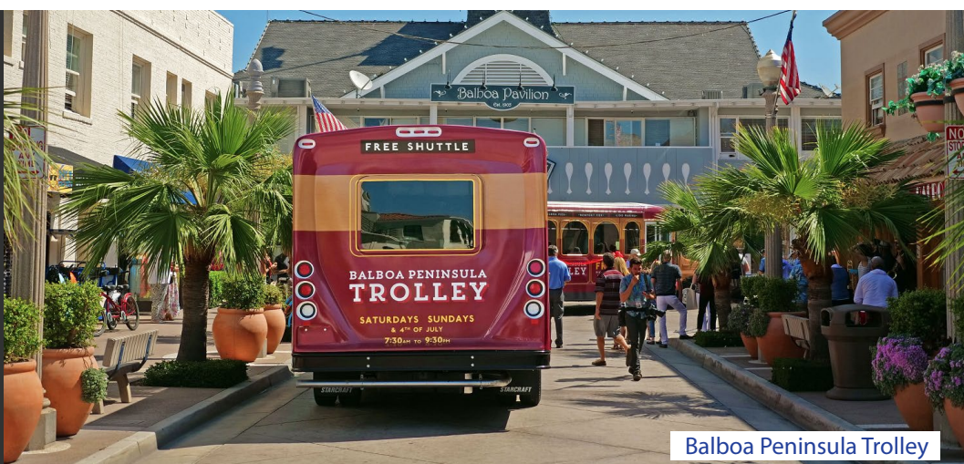
Balboa Peninsula Trolley