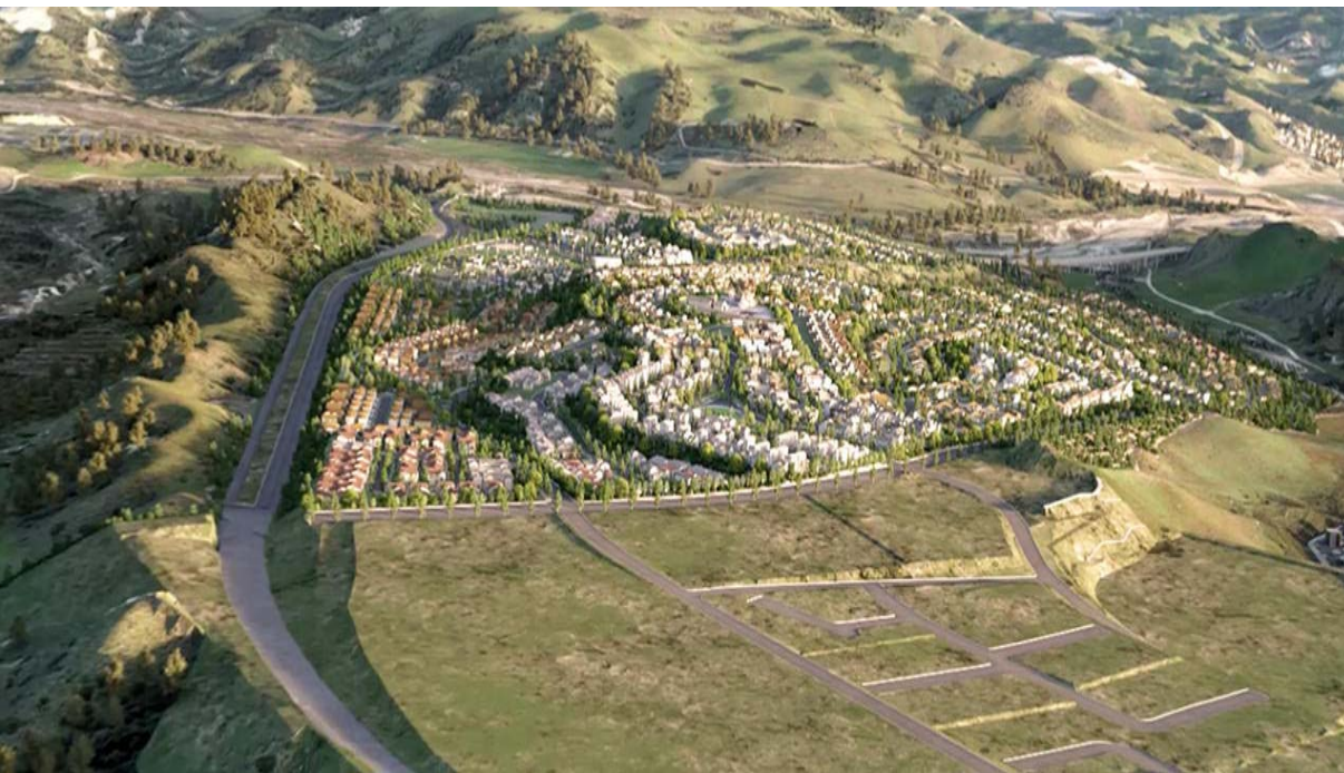
Rancho Mission Viejo