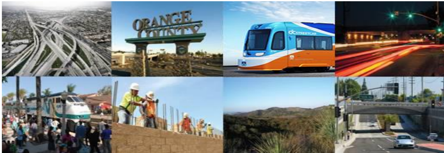
M2 – Measure M2